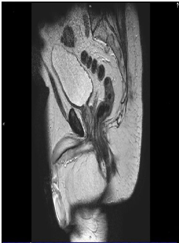
Figure 1 T2-weighted magnetic resonance image showing an anteverted coccyx and rectal impingement.