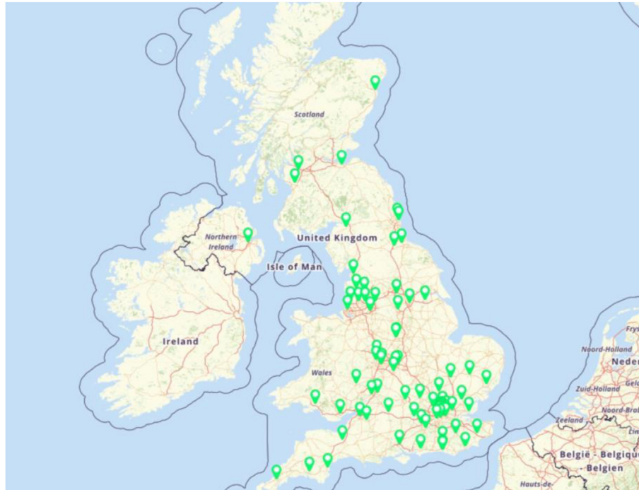
Fig. 1 – A map of the UK with the 88 hospital sites that signed up to recruit patients indicated in green markers.